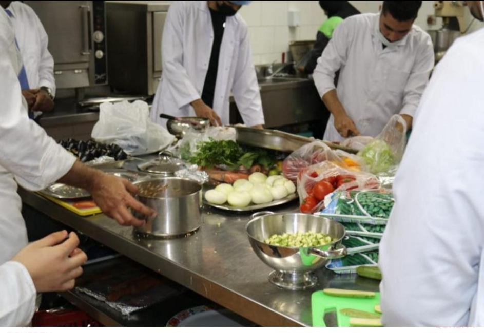
Protocol & Public Relations Affairs on AASTMT webpage