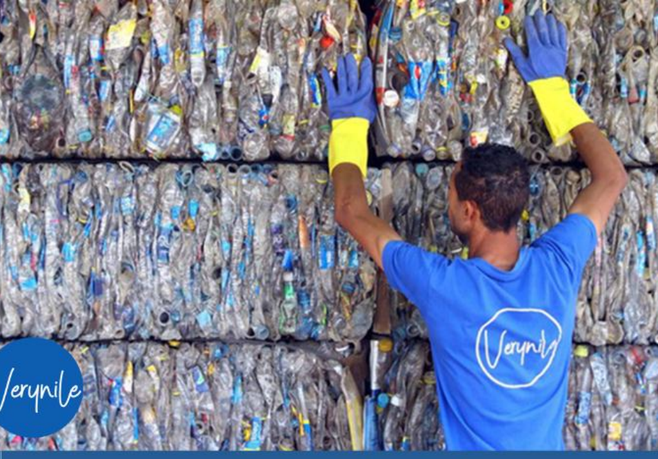
Thursday 18th of November 12:15pm AASTMT Smart Village Campus - Sencond Floor Conference Room