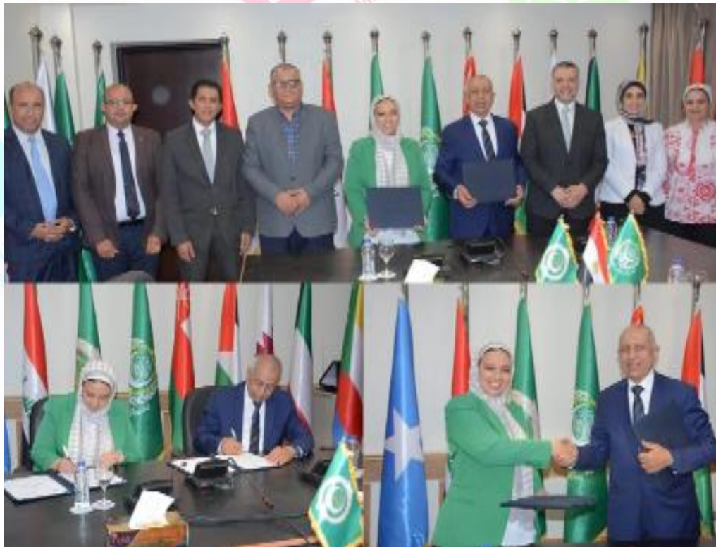
AASTMT- ARST MOU on AASTMT webpage

AASTMT signed a Memorandum of Understanding (MOU) with the Academy of Scientific Research and Technology (ARST) through the center of entrepreneurship that will support technological projects for ARST. Also, this MOU supports AASTMT's community engagement activities through supporting some of these projects. This MOU aims to enhance cooperation and support entrepreneurs and technological projects, specifically through AASTMT's entities and ARST's programs.