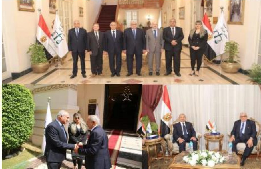
AASTMT President at the Egyptian Council of State.

The Arab Academy for Science, Technology and Maritime Transport (AASTMT) interacts with the Egyptian Council of State through official visits and cooperation, as seen in AASTMT's President's visit in 2023 to discuss human rights, enhancing cooperation with the Council's President and in training of AASTMTs' of Law students at the Council in the same year.