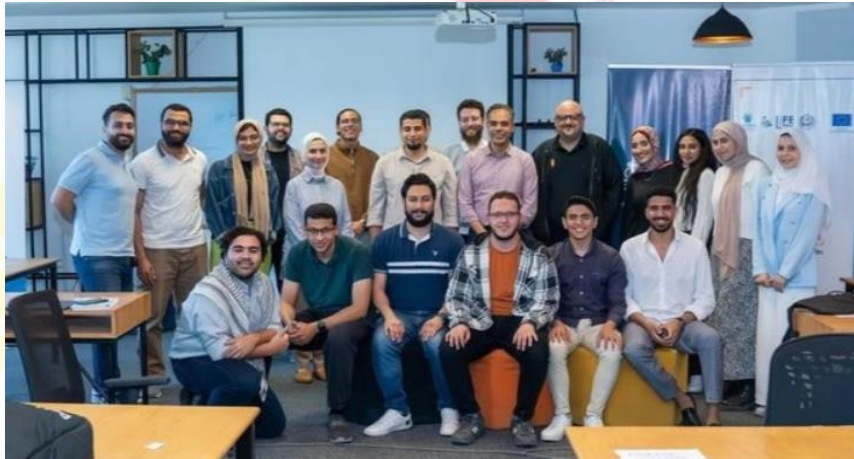
UNI-GREEN Project Workshop on AASTMT webpage

The Unigreen Project was a European Union-funded initiative that empowered Egyptian youth to develop entrepreneurial solutions for climate change mitigation. The Arab Academy for Science, Technology, and Maritime Transport (AASTMT) was a key partner, co-leading the project with the Life Makers Foundation. This workshop aims to increase the role of Egyptian universities as civil society organizations in advancing youth participation in climate change mitigation. The main role of AASTMT in the workshop is to build the capacity of university students, teaching assistants, and professors to address climate issues.