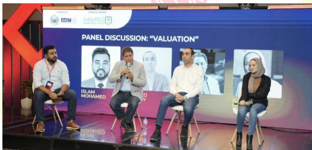
“Valuation” Panel, at Rally Accelerate Mentorship Bootcamp: “From local to Gloabl” on AASTMT webpage

As AASTMT supports the startups of its’ students, AASTMT conducted the “Valuation” Panel, at Rally Accelerate Mentorship Bootcamp: “From local to Gloabl”. The key is to determine a valuation that is grounded in market realities yet also aligns with the startup's unique growth potential and inherent risks.