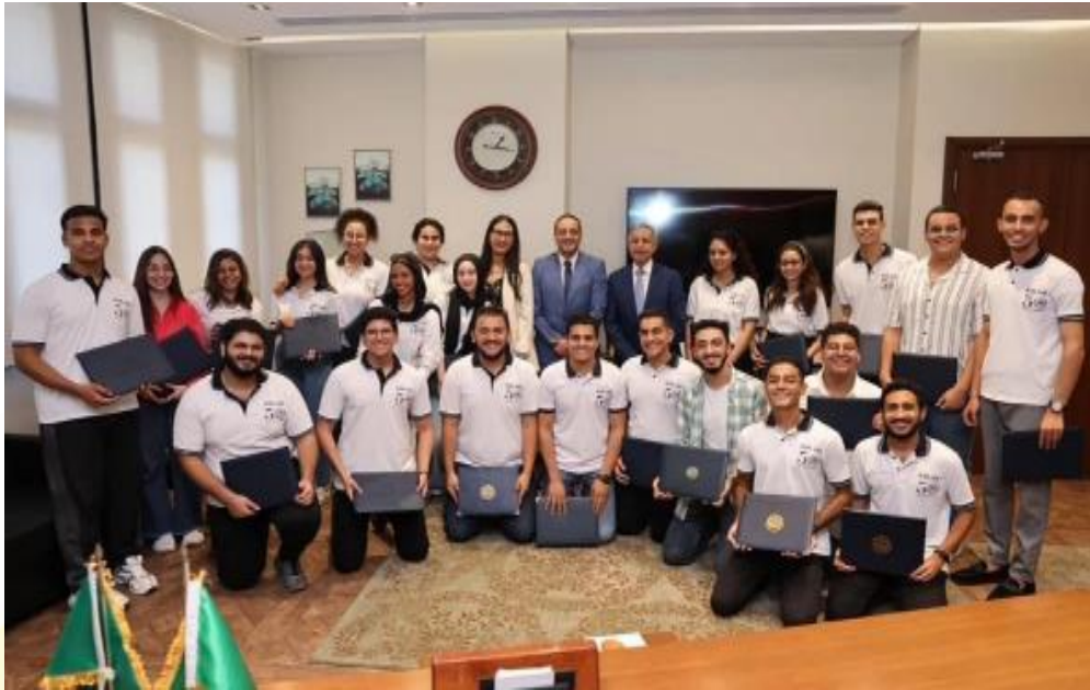
AASTMT President- AASTMT South Valley branch student unions and student meeting "Ask me Team Meeting" on AASTMT webpage