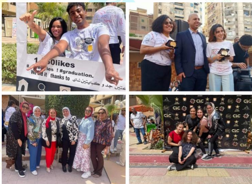
Photo Day for student union in college of Management on AASTMT webpage

A "PHOTO DAY" celebration was held for students from the Faculties of Administration, Languages, and Media. It was organized by the Department of Cultural and Social Activity and the Students' Union.