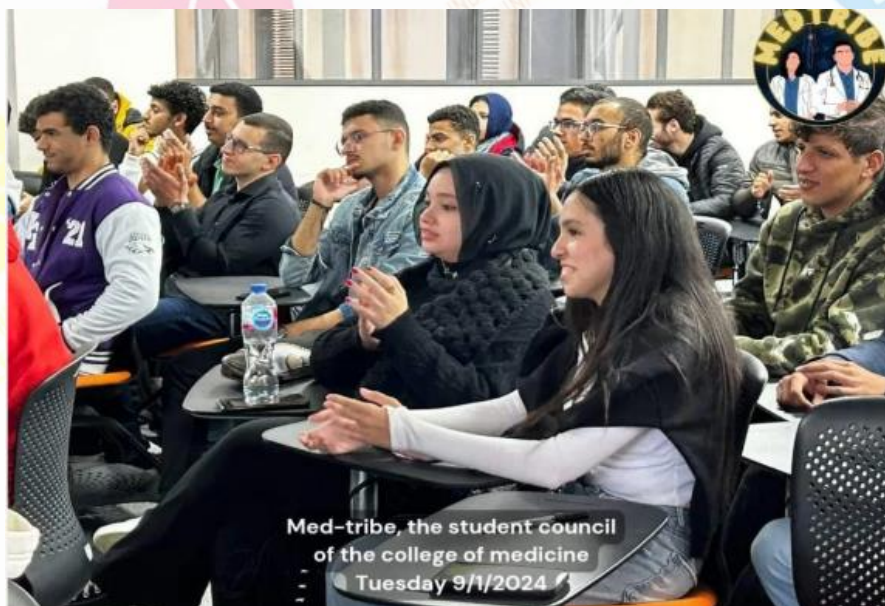
Student union meeting in the college of medicine on AASTMT webpage

During the meeting the student union assured that they work to meet the students' needs and to develop their life through supporting them in different fields.