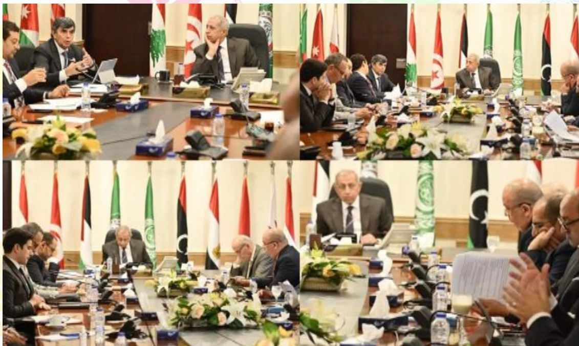
AASTMT President-Officials Meeting on AASTMT webpage

As AASTMT always cope the technology, labor market and the participation of its officials to take collaborative decisions, AASTMT president met some of AASTMT Official's the meeting was under the title "Innovation in Artificial Intelligence for Sustainable Agriculture Development in Arab Countries". Competition activities will be in "Horticultural activities in Doha-Qatar".