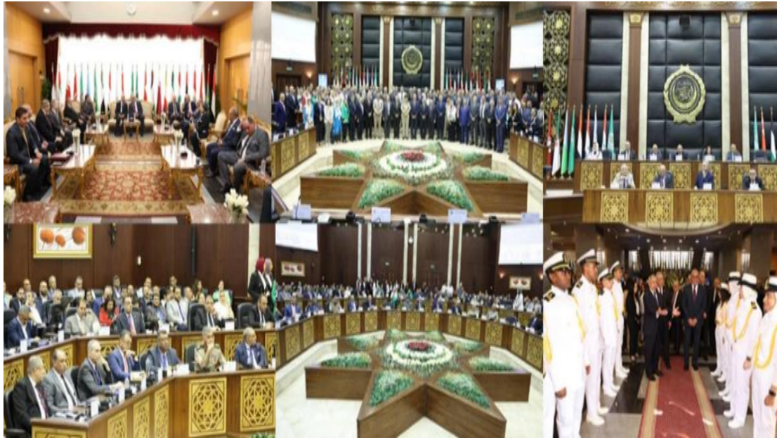
AASTMT Industrial Advisory Council 6th Session on AASTMT webpage