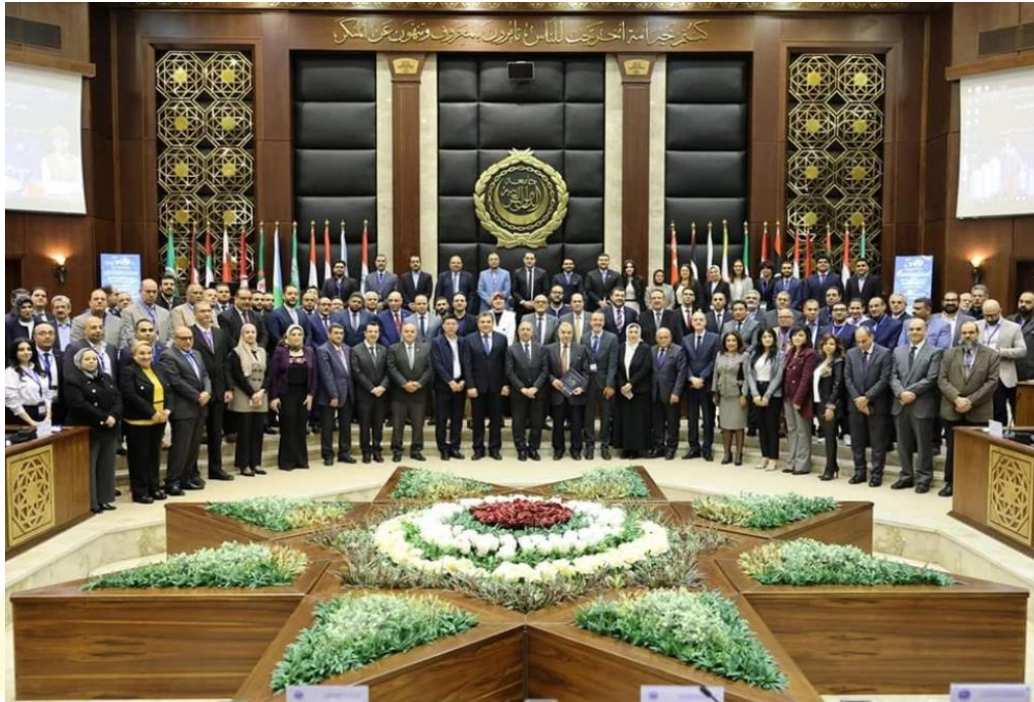
College of Engineering Industrial Advisory Council Meeting on AASTMT webpage