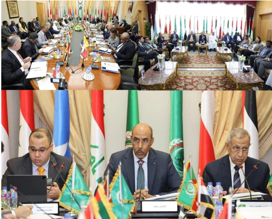
AASTMT Executive Council Meeting at (Expert Level- Session 12) on AASTMT webpage

The Executive Council Meeting of AASTMT at the expert level. The Executive Council meeting for preparing the draft agenda for the AASTMT's General Assembly, monitors and checks the implementation of its decisions, and prepare institutional plans. The work of the Executive Council helps strengthen cooperation between Arab countries and develop specialized professionals for the maritime transport sector and other scientific fields.