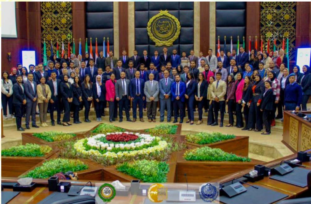
League of Arab State League 4th Edition on AASTMT webpage

The meeting introduces youth with the joint of Arab action and in coordination with different sectors of the League of Arab States. The training aimed to enhance students' skills in diplomacy and develop their understanding of how the Arab League operates. The goal was to prepare them for future roles in joint Arab initiatives. Students from various AASTMT colleges took on roles representing different Arab countries. The opening session was attended by the AASTMT President and other academy officials.