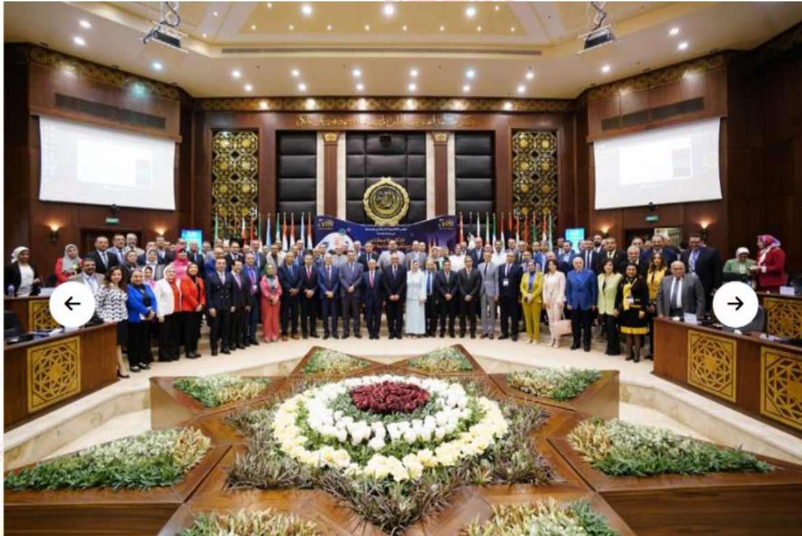
AASTMT Industrial Advisory Board 5th Session on AASTMT webpage