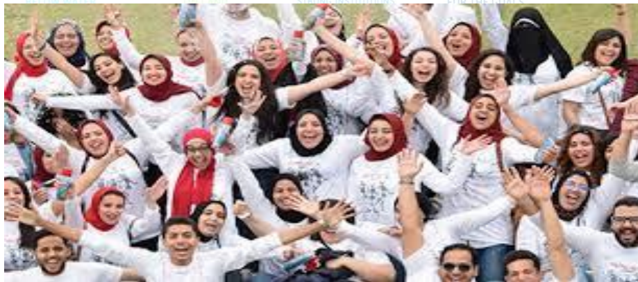
2021 – 2022 Students Clubs/Communities/ Associations on AASTMT webpage

The Deanery Of Student Affairs With The Student Unions Cooperation Is Focused On Creating A Successful Student Life From The Student Communities/Clubs/Associations To Be A Leader Within The AASTMT Colleges By Providing Support, Engagement, And Networking Opportunities To Students