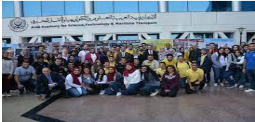
AASTMT Student Clubs and Societies on AASTMT webpage