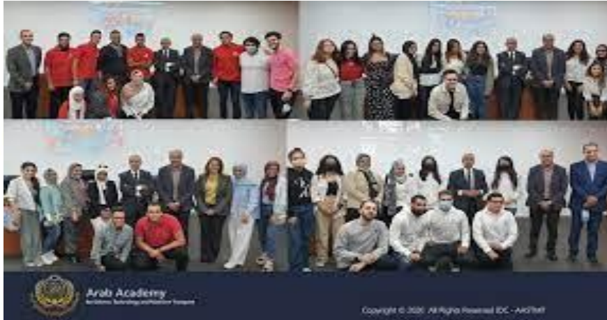
AASTMT President meeting with Smart Village Student Councils on AASTMT webpage

The AASTMT president met smart village campus student councils in the meeting. The President listened to their new plans and vision for creating a cooperative environment among AASTMT campuses.