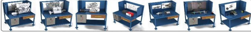
التصميمات المبدئية التي تم اقتراحها

بالعاون مع مركز البحوث والاستشارات لقطاع النقل النهري MRCC