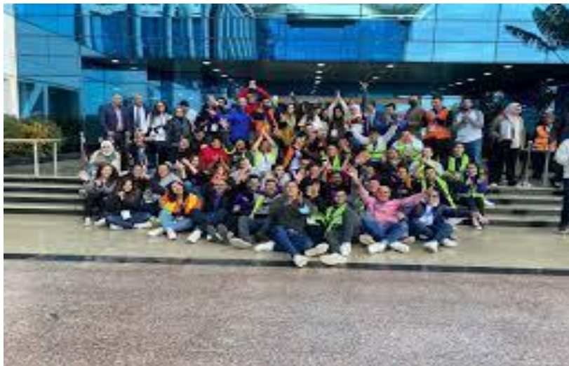
EST Preparation in Smart Village on AASTMT webpage