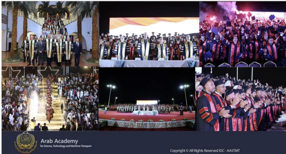
AASTMT South Valley Campus Graduation Ceremony "Aswan" SEP 18, 2024 AASTMT GENERAL

Graduation confirmed; the public notice does not state the headcount. The event is nonetheless included as a tracking milestone; any gender breakdown is taken from internal registrar data to maintain consistency in the year-end dataset.