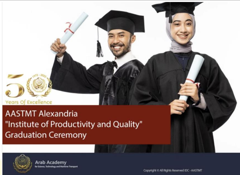
AASTMT Alexandria "Institute of Productivity and Quality" Graduation Ceremony