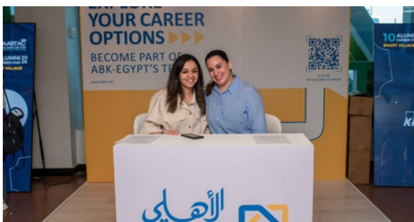
Smart Village Campus