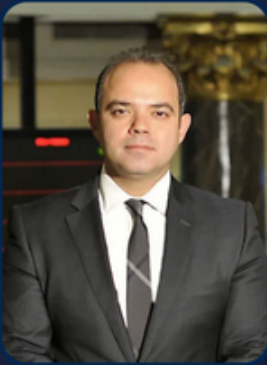
د. محمد فرید صالح وزير الاستثمار والتجارة الخارجية