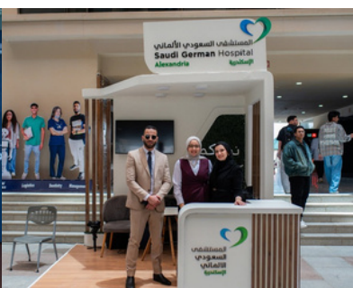
El Alamein Campus