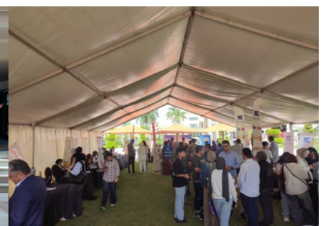
Port Said Campus