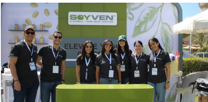
Alexandria Career fair – Main Campus