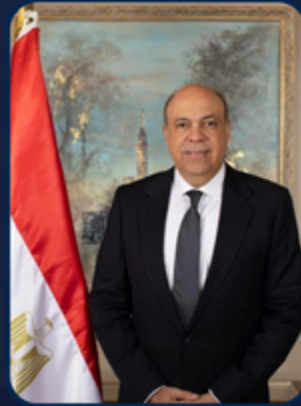
د. طيار ، سامح الحفنى وزير الطيران المدني