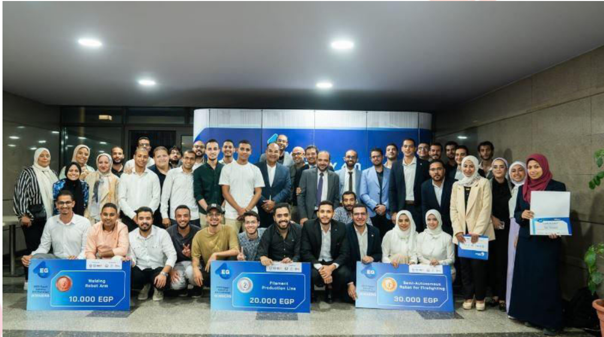
AASTMT Supports Egypt Industry Challenge 2023

commitment to empowering young innovators and fostering collaboration between academia and industry to drive sustainable industrial development in line with Egypt's Vision 2030. Through its partnership, AASTMT continues to promote innovation, applied research, and technology-based solutions that strengthen Egypt's position in the global industrial landscape.