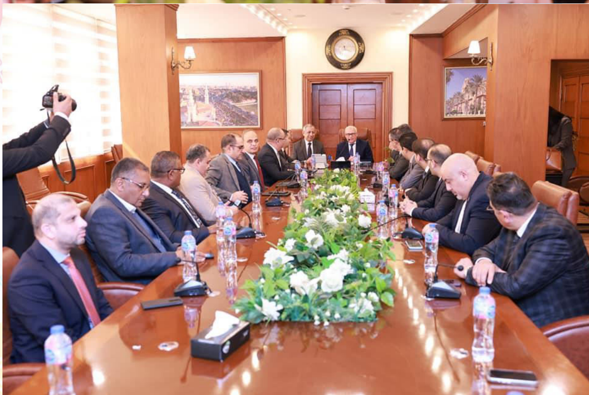
AASTMT and Port Said Governorate Strengthen Cooperation