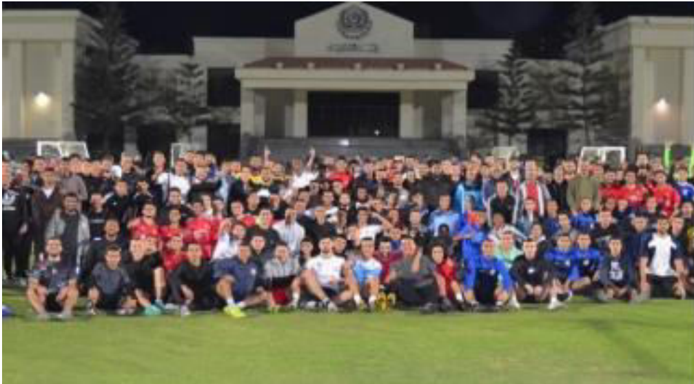
Providing Occasional Free Public Access to Green Spaces: The Annual Ramadan Sports Tournaments on Campus Grounds on AASTMT webpage