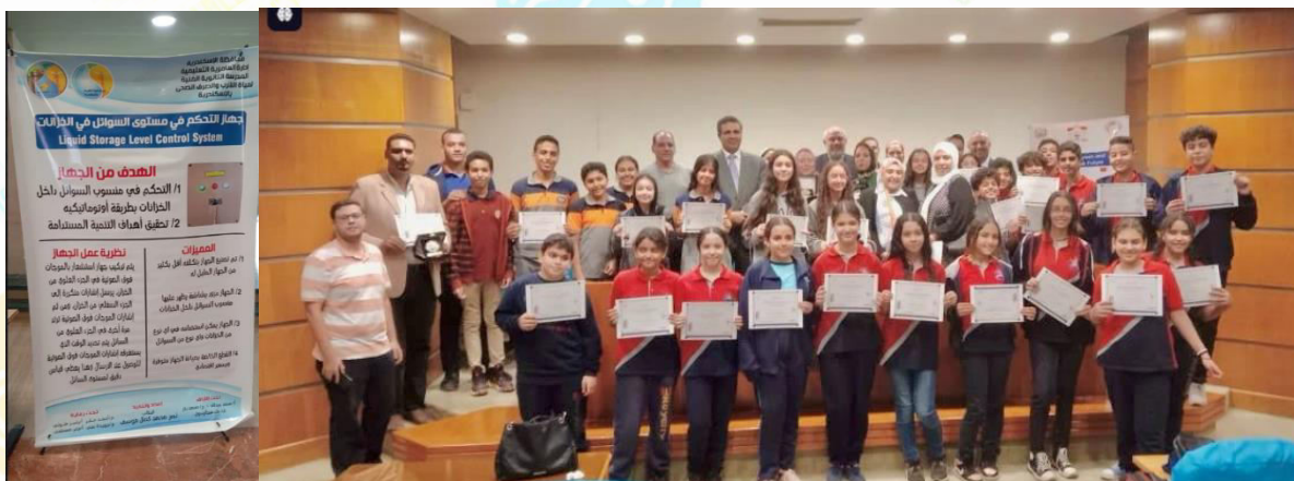
Community Engagement Program: Free Access to Campus Green Spaces & Facilities under the "Toward a Green and Sustainable Future" Initiative (2024) on AASTMT webpage

This program allowed non-university members to freely access and utilize the campus's extensive green spaces, botanical gardens, and the Planetarium. By removing entry barriers, AASTMT ensures that its sustainable infrastructure serves as a shared public asset, fostering environmental awareness and providing a safe, green recreational space for the city's youth."