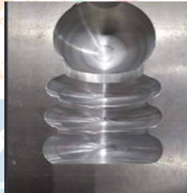
Some products from El-Eman Factory